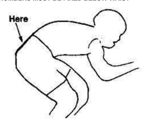
NO TIME MAY BE RECORDED IF NUMBER IS NOT CORRECTLY POSITIONED